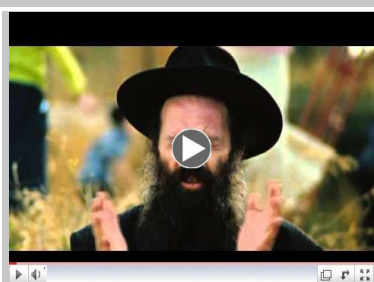
Ushpizin - Trailer

A Special Sukkot Event at The Ventnor Beach Pavillion