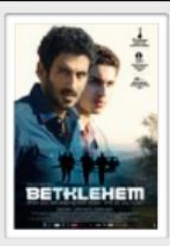
Nov. 24th 1:30 & 7:00pm