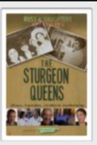
Nov. 10th 1:30pm