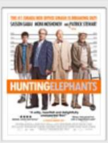
Nov. 10th 7:00pm